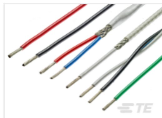
TE Part #8549033001 99M0121-24-0/2L