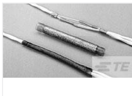
TE Part #481899-000 D-155-0575