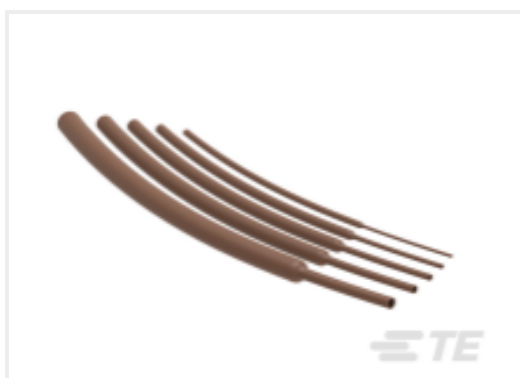
TE Part #CAT-HST-RNF100-X RNF-100-X Heat Shrink Tubing