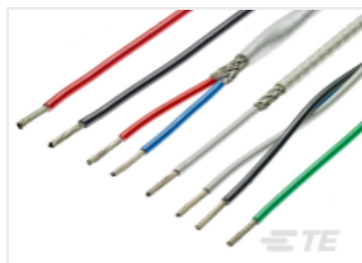
TE Part #4614773001 99M0121-24-0/9