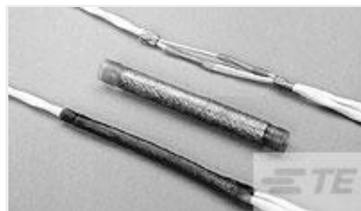
TE Part #682035-000 D-150-0177