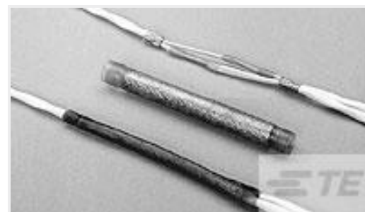
TE Part #705692-000 D-150-0178