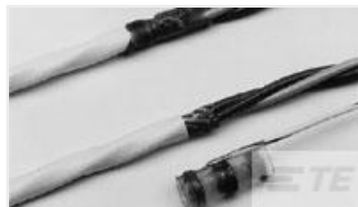
TE Part #624513-000 D-146-0208