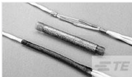
TE Part #766146-000 D-150-0170