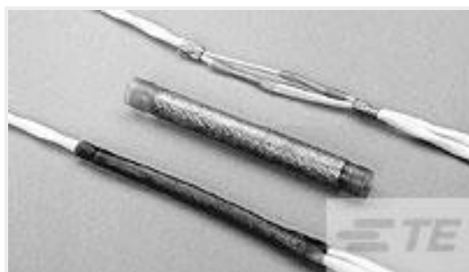
TE Part #193495-000 D-150-0179