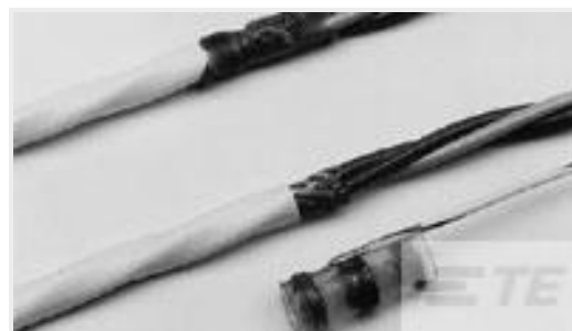
TE Part #127429-000 SO63-5-9030