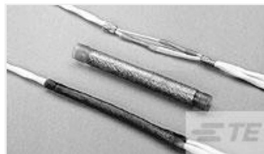
TE Part #A11769-000 D-150-0321