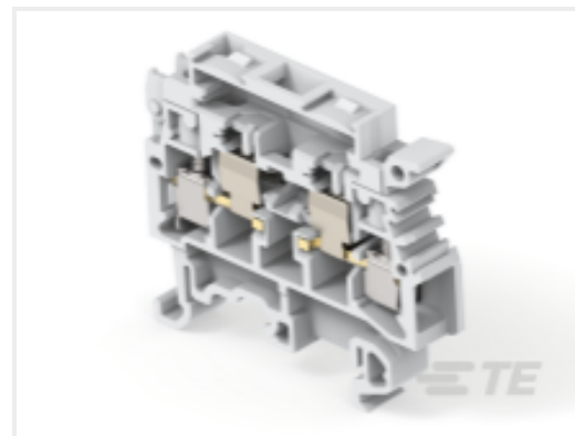
TE Part #1SNA115657R2500 M4/8.SF