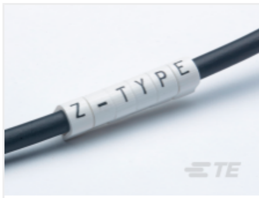
TE Part #CAT-T3437-Z1 Z-Type Push-On Markers