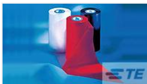
TE Part #F55931-000 1966-RIBBON