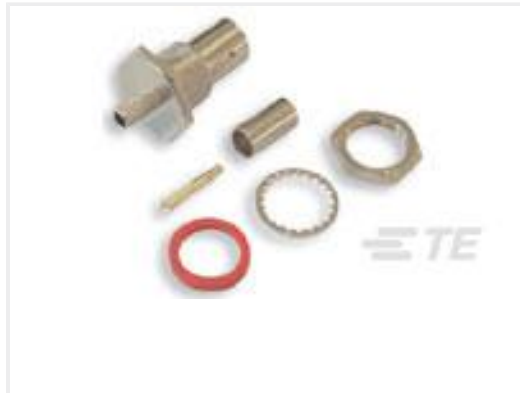
TE Part #1-1337548-0 BNC RM BHJ Hex 50Ohm Nickel Pltd RG174A/