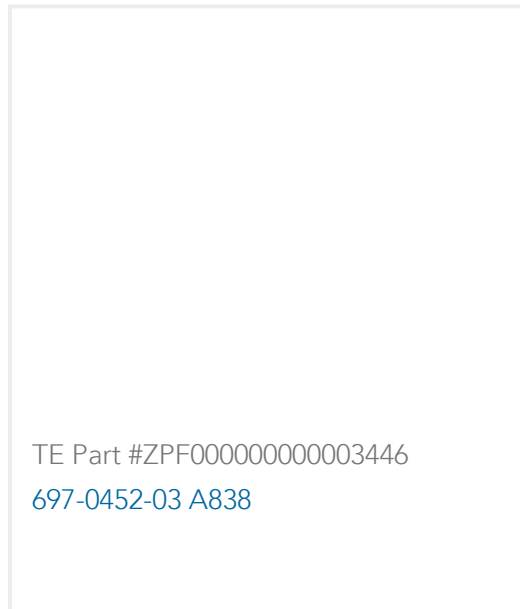
TE Part #ZPF000000000003446 697-0452-03 A838