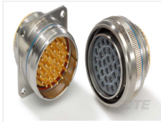
TE Part #ZPF000000000007308 983-0S 08-03 PN