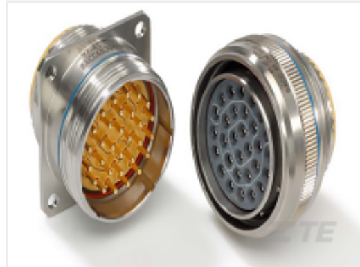
TE Part #ZPF000000000007317 983-0S 10-05 P6