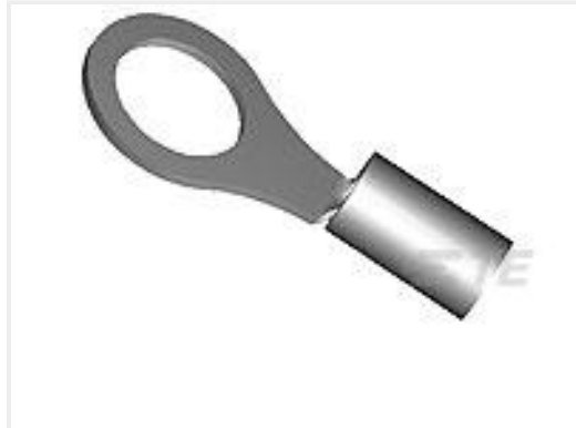
TE Part #321897 DG 22-16COM 22-18MIL HT R 8