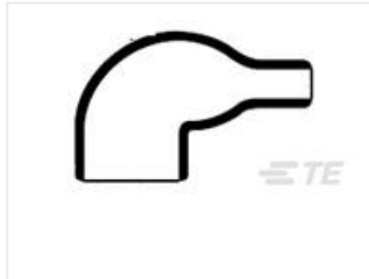
TE Part #814309-000 222A111-3-0