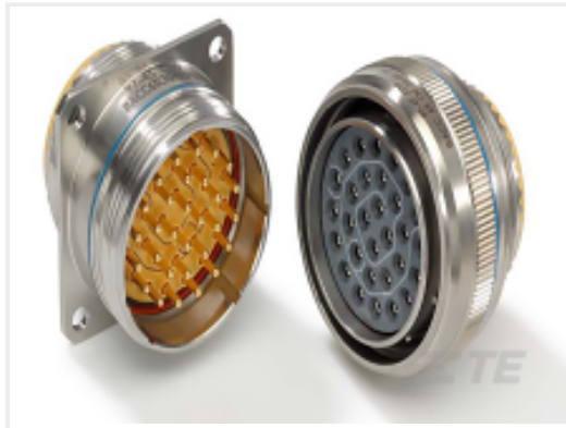
TE Part #ZPF000000000007358 983-0S 12-12 PN