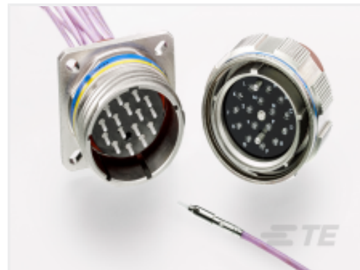
TE Part # YMC8010-F-21-16PN0 ARINC 801, REC