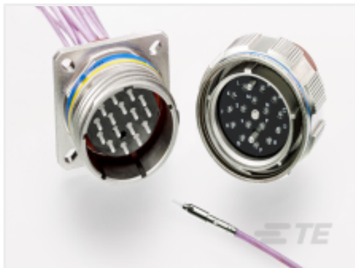
TE Part # YMC8017-F-21-16PN0 ARINC 801, TYPE 1 JAM NUT CONNECTOR