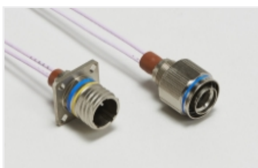
MC801 Fiber Connectors(111)