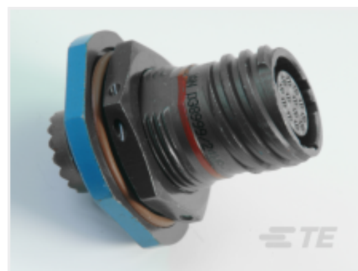
TE Part # CAT-D38999-DTS16Q Jam Nut: D38999, 11-98 Insert, Black Zinc Nickel Plating