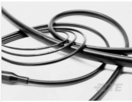
TE Part #CAT-R2137-RW200 Single Wall RW 200: Heat Shrink Tubing, 2:1 Shrink Ratio