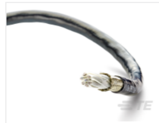
TE Part #8163673001 VG-95218-T025-G004