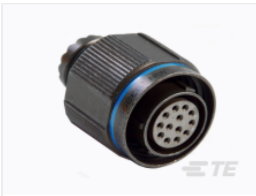
TE Part #YDTS26Z11-98SNV001 PLUG ASSY