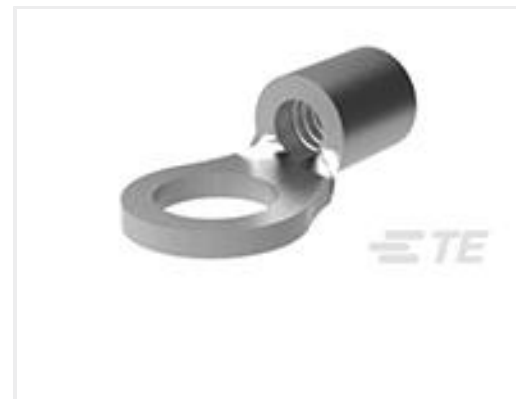
TE Part #2-31425-3 TERM,BUDG, RT, 26-22, #2, NIPL