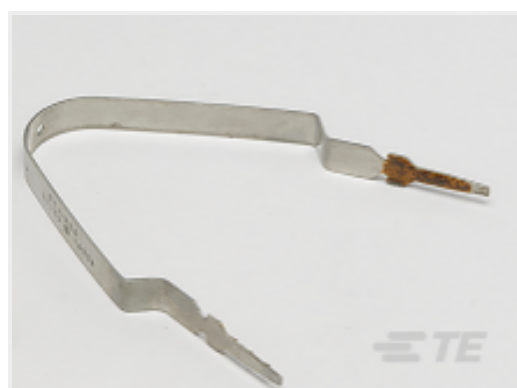
TE Part #CTJ-R06 TOOL REMOVAL