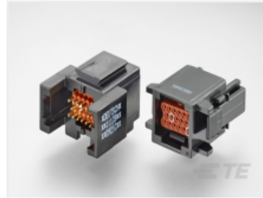
TE Part #ABC06N-22S IN-LINE PLUG