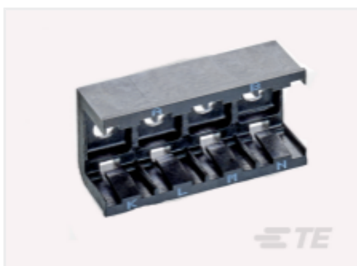
TE Part #DCR-1A-06 COMPOSIT RAIL