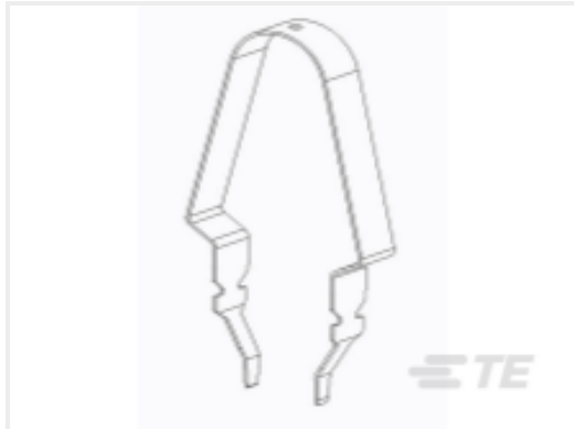
TE Part #CTJ-R12 TOOL REMOVAL