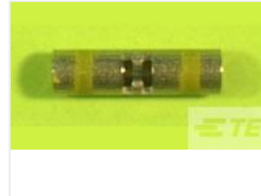
TE Part #680332-000 D-609-12