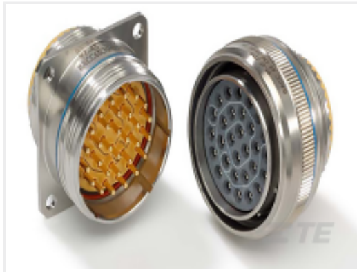
TE Part #ZPF0000000000008033 983-1YE 10-05 PN