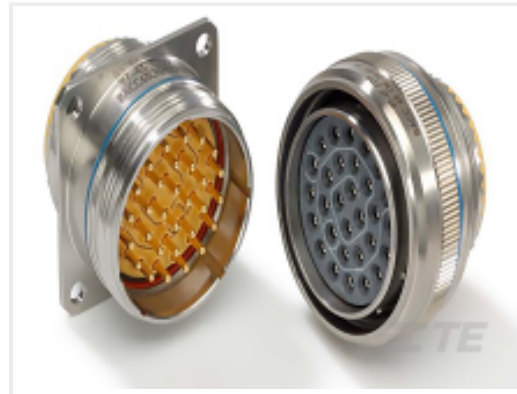
TE Part #ZPF0000000000008032 983-1YE 10-05 P6