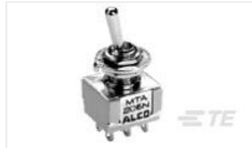
TE Part #6-1437558-9 MTE106E=(MSTE) SW TOG WATERPRO