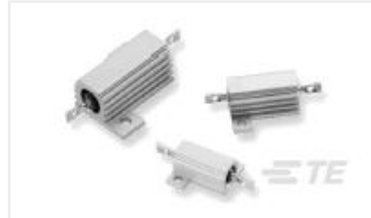
TE Part #1-1879071-2 THS50 1R2 5%