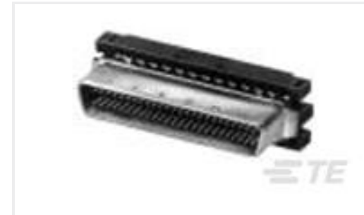
TE Part #5749621-5 50 50S CABLE PLUG CONN/COV KIT