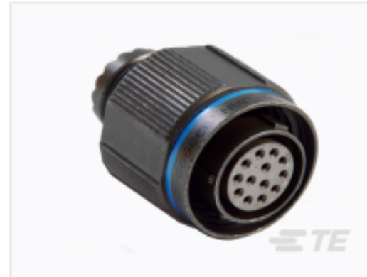
TE Part #YDTS26W11-98SNV001 PLUG ASSY