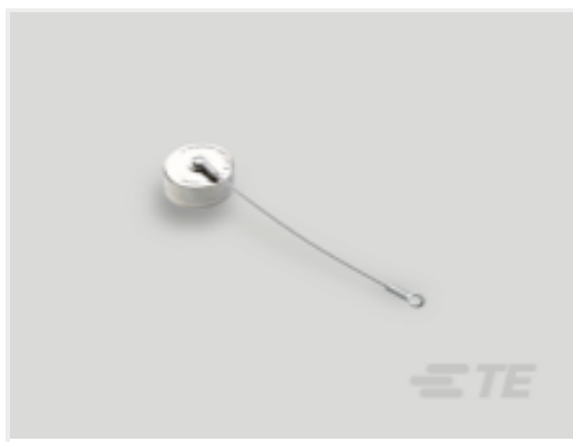
TE Part #YDTS33W13RV0010000 DUST COVER ASSEM