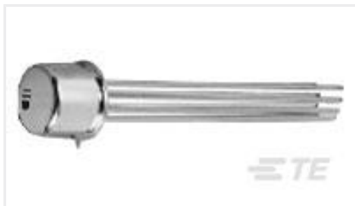
TE Part #1-1617122-0 JMACD-26XLS = M39016/15-105L