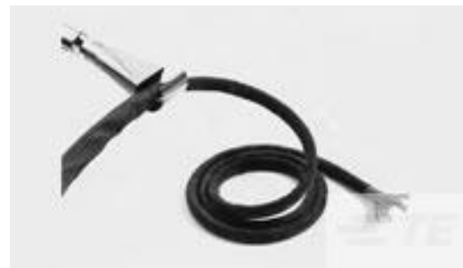
TE Part #CB7764-000 RW-200-1/8-0-SP