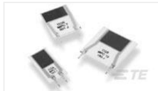
TE Part #1-1623776-5 MPC5 50R 5%