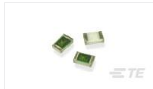
TE Part #1676330-2 RN 0805 3K65 0.1% 10PPM 1KRL