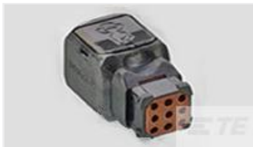
TE Part #D369-P99-NP1 369 9 WAY PLUG, CRIMP, PIN