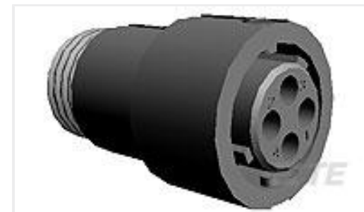
TE Part #1445390-3 PLUG,8-4,LG INS,STD KEY