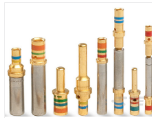
TE Part #ZPF000000000000345 006-0912-20 A