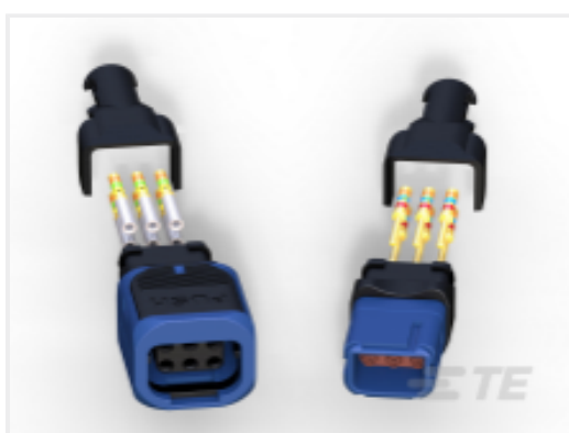
TE Part # D369-P66-NP0 369 6 WAY PLUG, NO CONTACTS, PIN