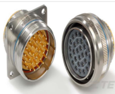
TE Part #ZPF000000000007174 983-0RS 08-98 PN