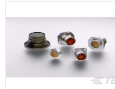
TE Part #YDTS20Y13-98XNV001 HERM RECP