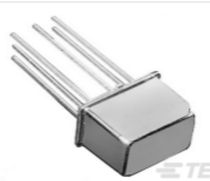
TE Part #1617147-5 JMGAP-26P = M39016/17-030P