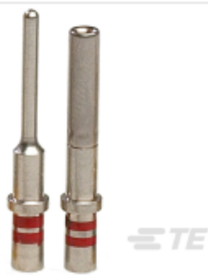
TE Part #ZPF000000000001261 097-0267-16 A1267