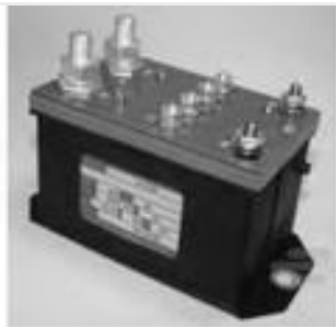
TE Part #1616058-6 A703CD (FAA/PMA)=RELAY