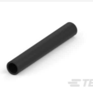
TE Part #CAT-HST-BSTS BSTS/BSTS-FR Heat Shrink Tubing