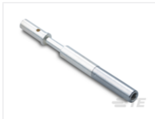
TE Part #Y5015-000000100109 SIZE 16S SOCKET CONTACT