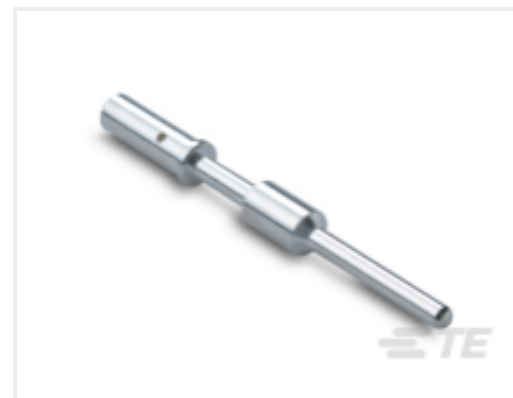
TE Part #Y5015-000000100107 SIZE 16S PIN CONTACT