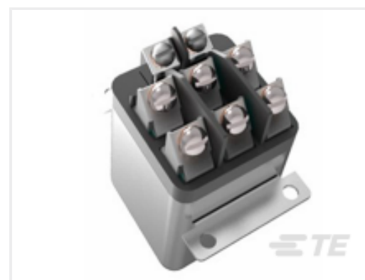
TE Part #1617807-5 FC-335-SY8= RELAY, 3PST