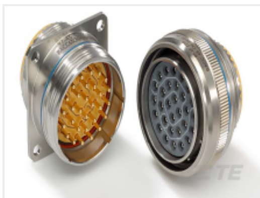
TE Part #ZPF000000000007174 983-ORS 08-98 PN