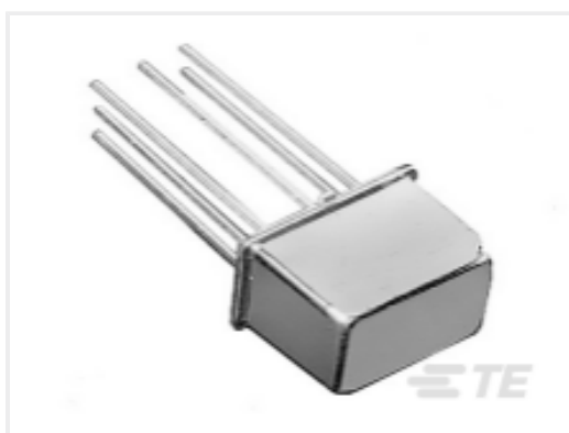
TE Part #1617147-5 JMGAP-26P = M39016/17-030P