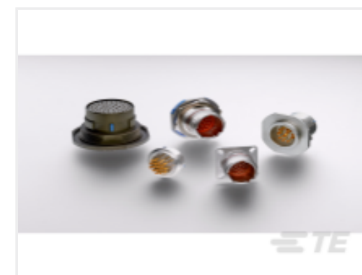
TE Part #YDTS20Y13-98XNV001 HERM RECP