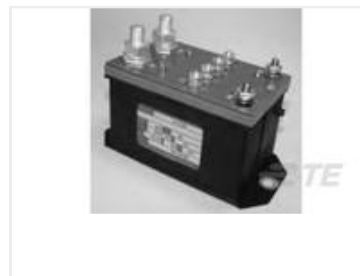
TE Part #1616058-6 A703CD (FAA/PMA)=RELAY