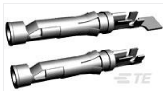
TE Part #2-66104-5 III+ SKT,24-20,TIN-LEAD,STRIP