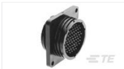
TE Part #1-206455-1 23-63 SZ CPC PSTD PIN RECPT LF