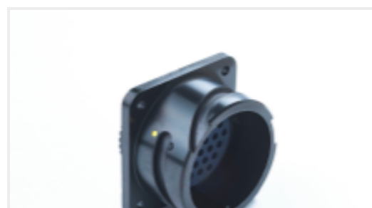
TE Part #Y5015-000000100145 FIXED PIN CONNECTOR