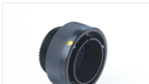
TE Part #Y5015-000000100025 FREE PIN CONNECTOR