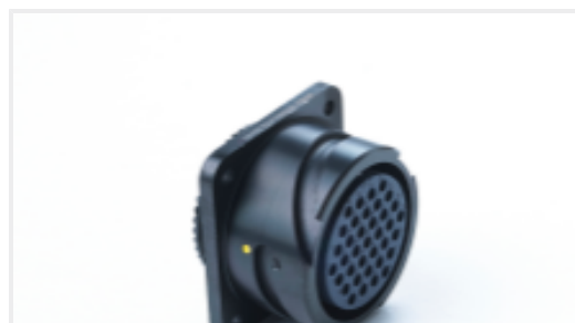
TE Part #Y5015-000000100146 FIXED SOCKET CONNECTOR