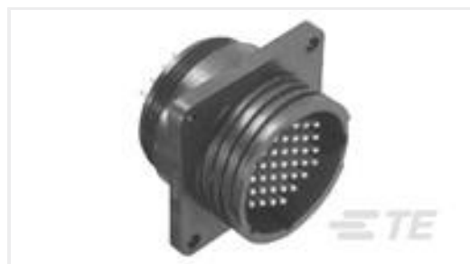
TE Part #213854-4 CPC RECPT ASSEMBLY SIZE 23-37