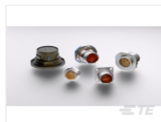
TE Part #YDTS20Y13-98XNV001 HERM RECP