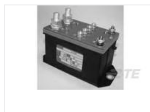
TE Part #1616058-6 A703CD (FAA/PMA)=RELAY