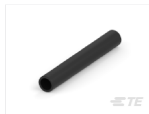
TE Part #CAT-HST-BSTS BSTS/BSTS-FR Heat Shrink Tubing