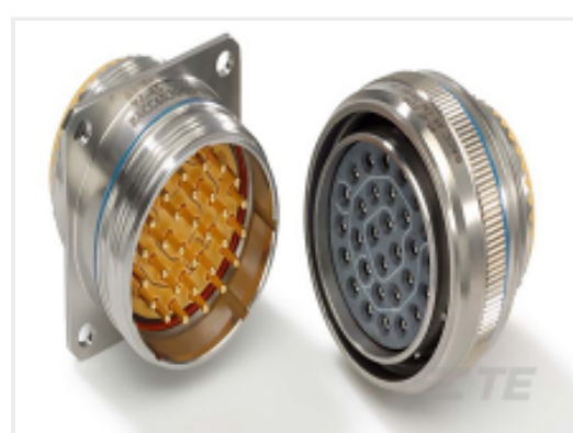
TE Part #ZPF000000000007174 983-ORS 08-98 PN