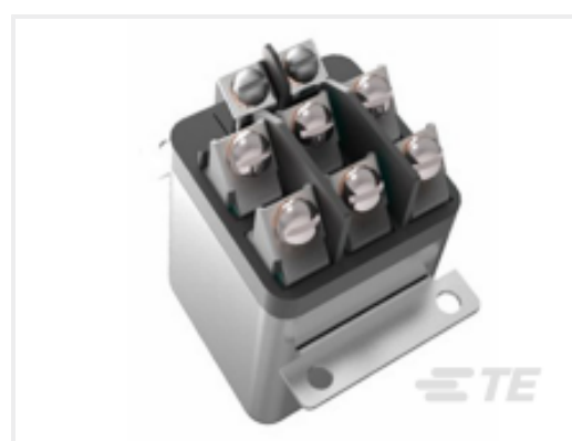
TE Part #1617807-5 FC-335-SY8= RELAY, 3PST