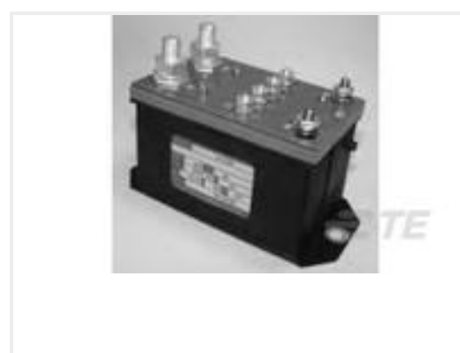
TE Part #1616058-6 A703CD (FAA/PMA)=RELAY