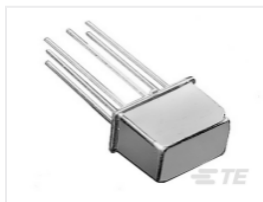
TE Part #1617147-5 JMGAP-26P = M39016/17-030P