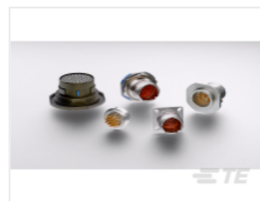
TE Part #YDTS20Y13-98XNV001 HERM RECP