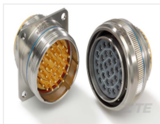
TE Part #ZPF000000000007174 983-ORS 08-98 PN