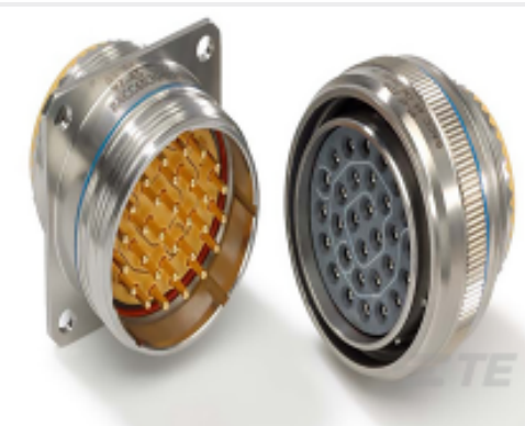
TE Part #ZPF000000000007174 983-ORS 08-98 PN