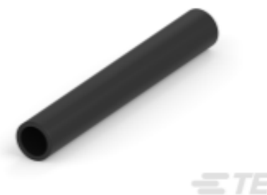
TE Part #CAT-HST-BSTS BSTS/BSTS-FR Heat Shrink Tubing