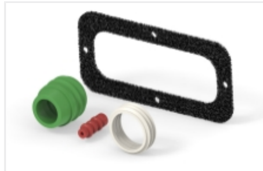
Connector Seals & Cavity Plugs(4)