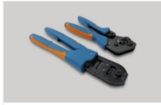
Hand Crimping Tools(32)