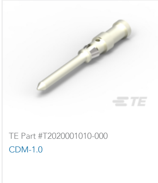
TE Part #T2020001010-000 CDM-1.0