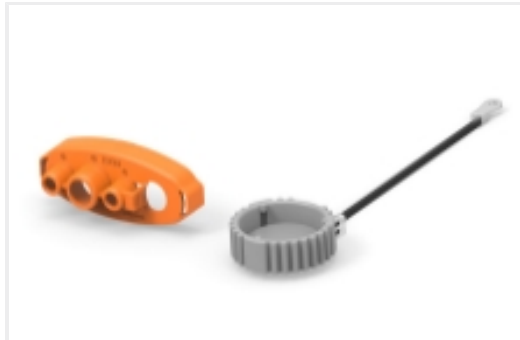
Connector Caps & Covers(2)