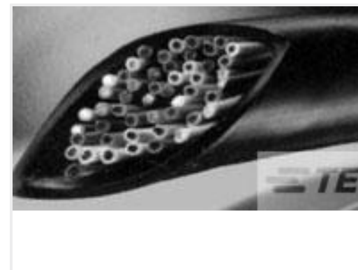
TE Part #5550084009 NT-1-1/4-0-SP