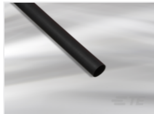
TE Part #CAT-HST-BATTU BATTU Heat Shrink Tubing