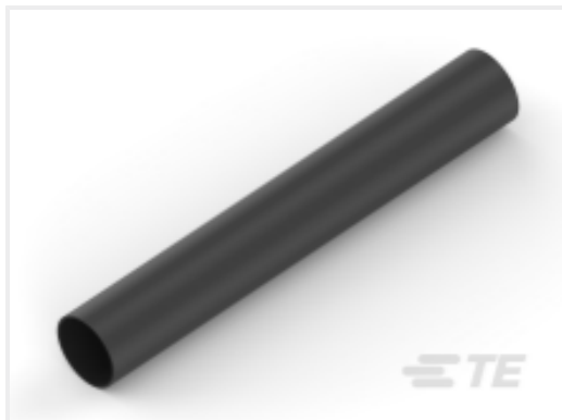
TE Part #CAT-HST-DWP125 DWP-125 Heat Shrink Tubing