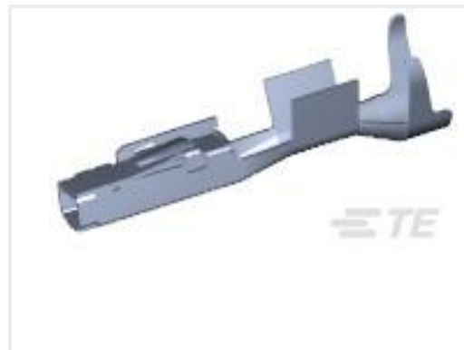
TE Part #7-1452671-3 MCON 1.2 LL REC SWS AG