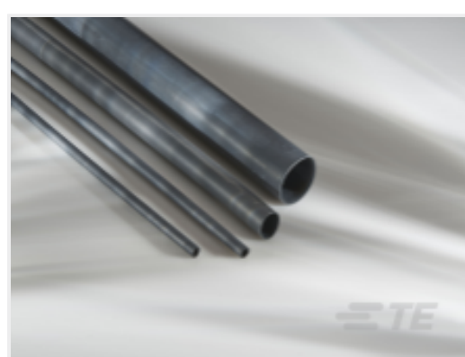
TE Part #EH2294-000 DWFR-40/13-0-STK