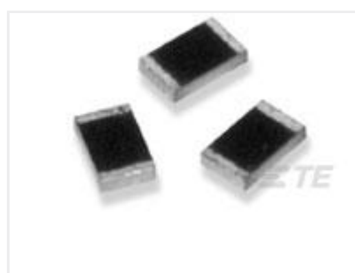
TE Part #4-1879278-9 RP 2A 41K2 0.1% 15PPM CUT LENGTH