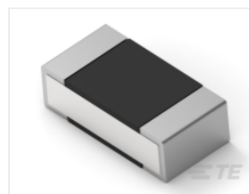
TE Part #2176311-3 RP 1E 0.1W 1K21 0.1% 25PPM 1K RL