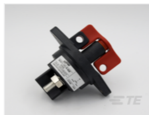
TE Part #K1144808 Battery Disconnecter 35-511-131-R-900