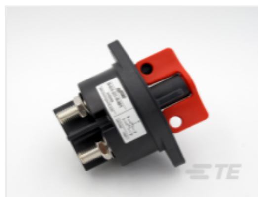
TE Part #K1137217 Battery Disconnecter 35-524-231-R-900