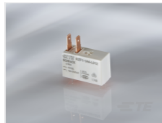
TE Part #1833011-5 RZF1-1A4-L018