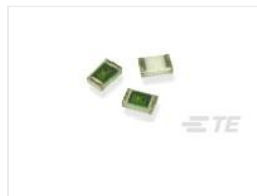
TE Part #2-1879129-5 RN 0402 1K47 0.1% 10PPM CUT LENGTH