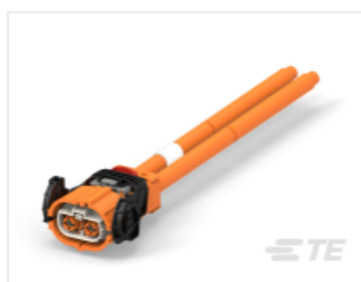
TE Part #1-2286937-5 2POS,HVP800,180 DEG,50 SQMM, COD A,CS