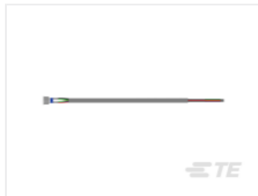
TE Part #2317659-9 AV25 DPM 3A MOVING RING POWER R&G 12V FL