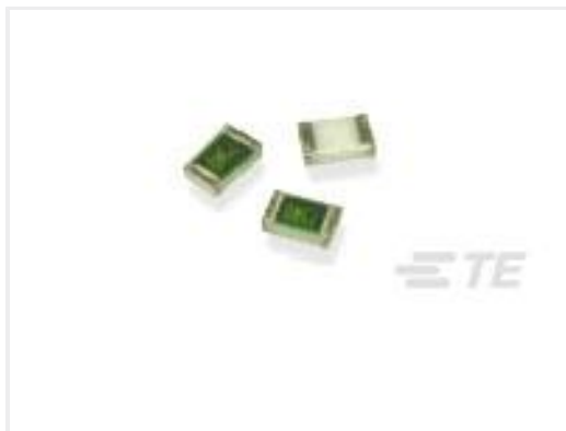
TE Part #2-1879129-5 RN 0402 1K47 0.1% 10PPM CUT LENGTH