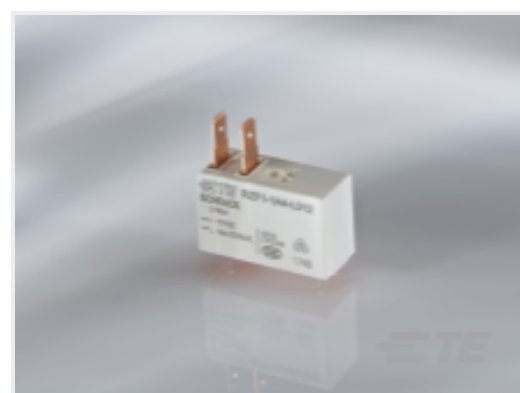
TE Part #1833011-5 RZF1-1A4-L018