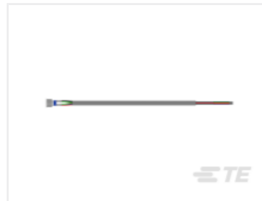
TE Part #2317659-9 AV25 DPM 3A MOVING RING POWER R&G 12V FL