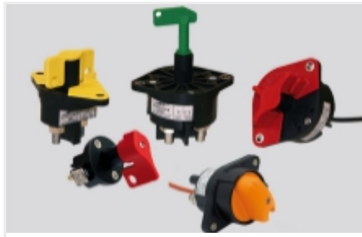
Battery Disconnect Switches(164)