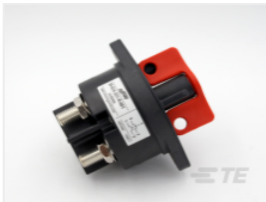
TE Part #K1137217 Battery Disconnect 35-524-231-R-900