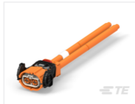
TE Part #1-2286937-5 2POS,HVP800,180 DEG,50 SQMM, COD A,CS