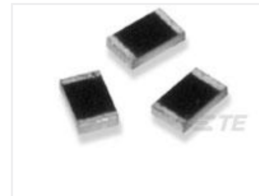
TE Part #4-1879278-9 RP 2A 41K2 0.1% 15PPM CUT LENGTH R&G