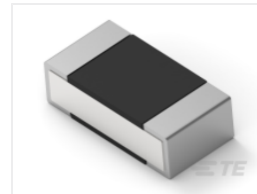
TE Part #2176311-3 RP 1E 0.1W 1K21 0.1% 25PPM 1K RL