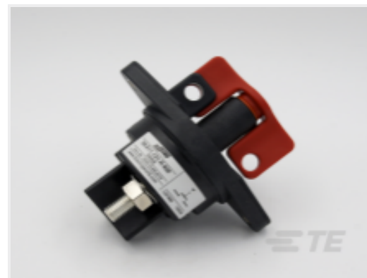
TE Part #K1144808 Battery Disconnect 35-511-131-R-900