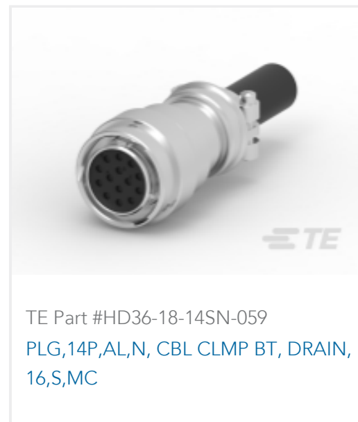
TE Part #HD36-18-14SN-059 PLG,14P,AL,N, CBL CLMP BT, DRAIN, 16,S,MC