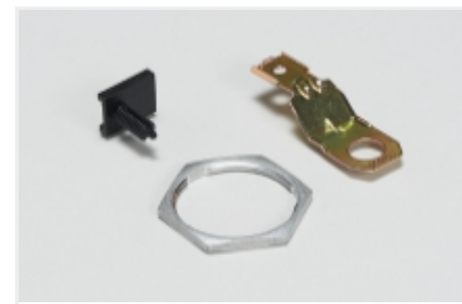
Other Automotive Connector Accessories(7)