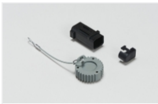
Automotive Connector Caps & Covers (14)