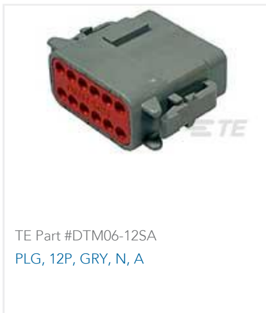
TE Part #DTM06-12SA PLG, 12P, GRY, N, A