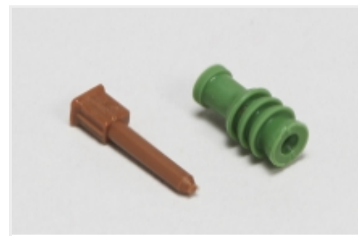
Automotive Seals & Cavity Plugs(1)