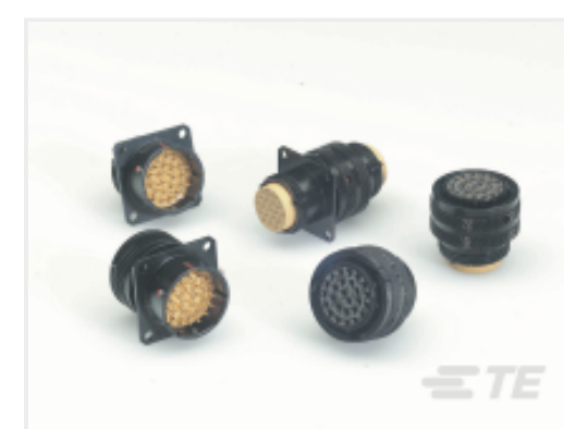
TE Part #ZPF000000000018794 FDBA 50H 8-98 PN-K