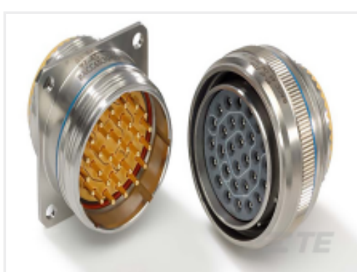
TE Part #ZPF000000000164349 983-ORS 10-05 PY