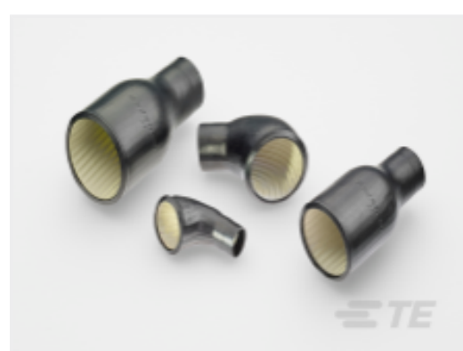
TE Part #EK7273-000 202S132-25C-0