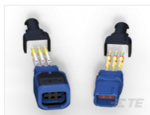
TE Part #YD369-HP99-NP00000 369 HARSH 9 WAY PLUG, PIN - BACC65CP3PN