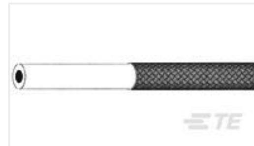
TE Part #D561523001 RAY-101-4.0(100)