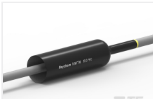
TE Part #142782-000 MWTM-25/8-1500/S(S10)