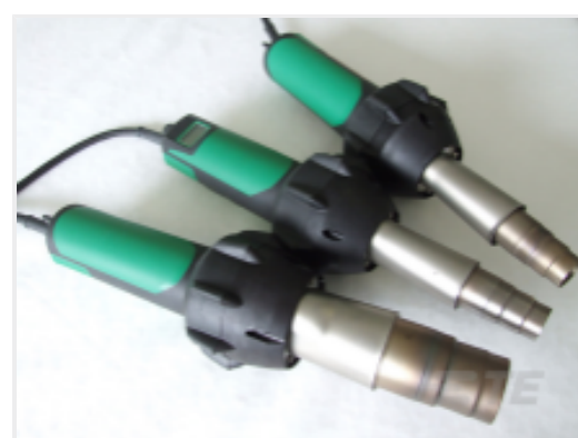
TE Part # EG1118-000 CV1981-ST-120V1600W-US