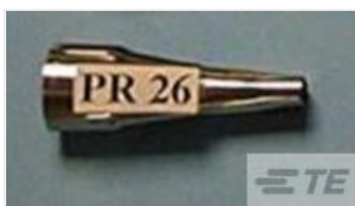
TE Part # 991967-000 PR-26-REFLECTOR