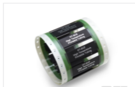
TE Part #CAT-T3437-H85999A HT-SCE High Temperature Sleeves