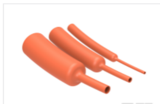
TE Part #CAT-HST-RNF3000 RNF-3000 Heat Shrink Tubing