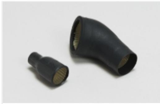
EMI Shielded Boots(79)