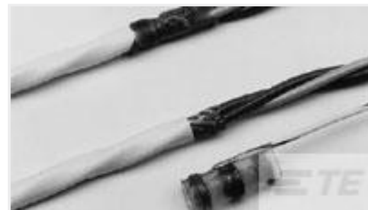
TE Part #615595-000 B-150-07-S