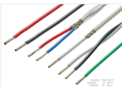
TE Part #109761-000 44A0141-20-9/90/92/96