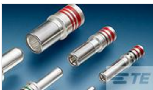
TE Part # 0662-207-0882 CONT SOC ASSY