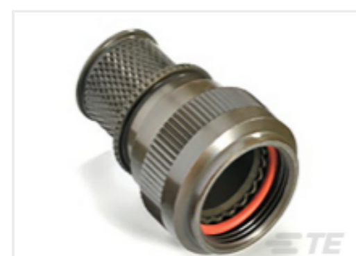
TE Part #BTH1-15-08-1-ZN BTH1-15-08-1-ZN