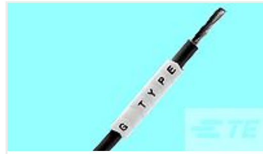
TE Part #EC2125-000 07201436