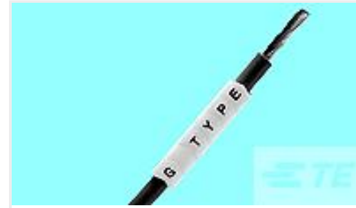
TE Part #EC2170-000 07211429