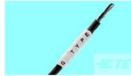
TE Part #EC2158-000 07211417