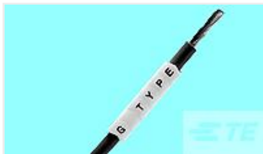
TE Part #EC2157-000 07211416