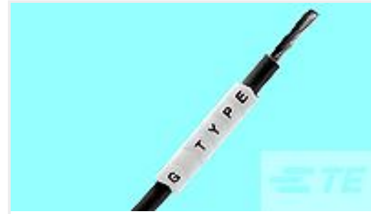
TE Part #EC2151-000 07211411