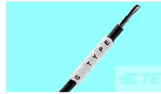
TE Part #EC2165-000 07211424