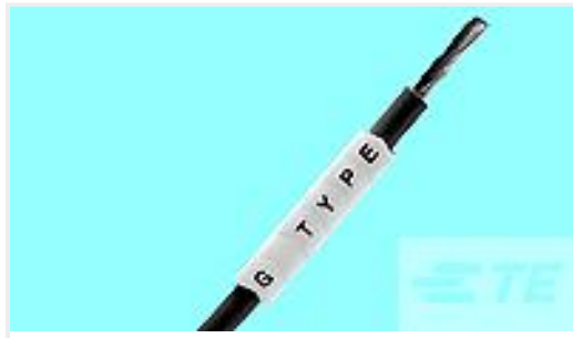
TE Part #EC2175-000 07211434