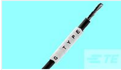
TE Part #EC2176-000 07211435