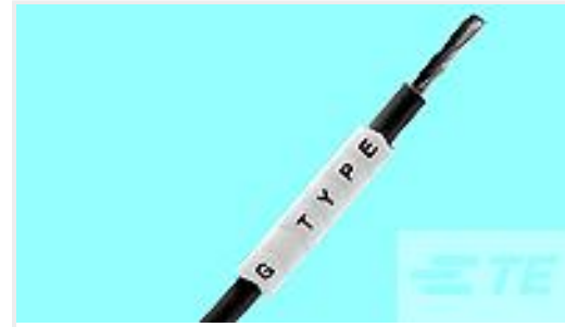
TE Part #EC2170-000 07211429