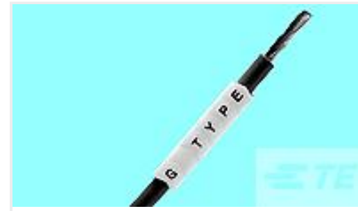
TE Part #EC2165-000 07211424