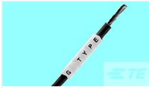
TE Part #EC2178-000 07211437