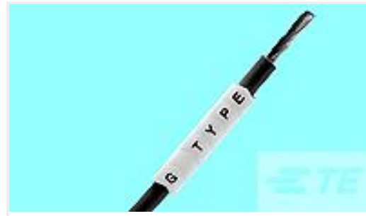
TE Part #EC2176-000 07211435