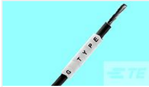
TE Part #EC2158-000 07211417