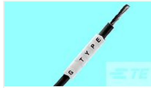
TE Part #EC2151-000 07211411