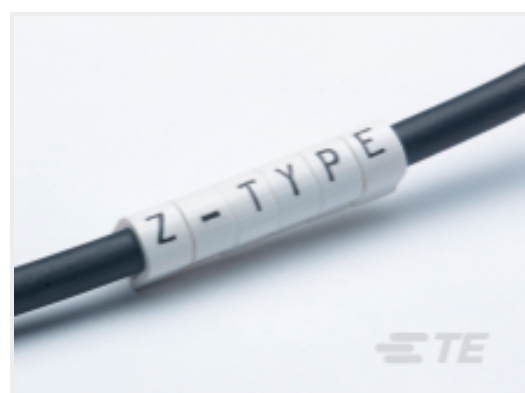
TE Part #CAT-T3437-Z1 Z-Type Push-On Markers