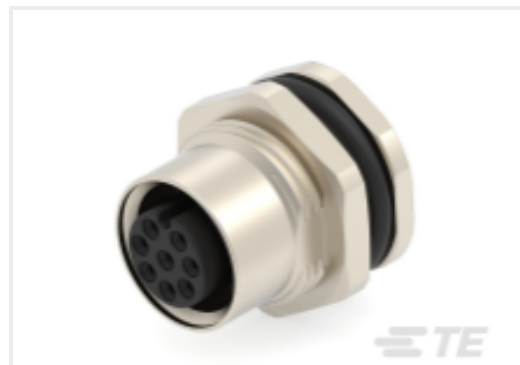
TE Part #T4131012081-000 M12,REAR MOUNT,FEMALE,A,8P, SOLDER WIRE