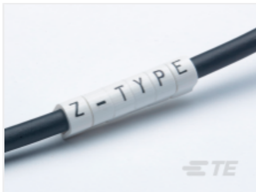
TE Part #EC1039-000 06181902