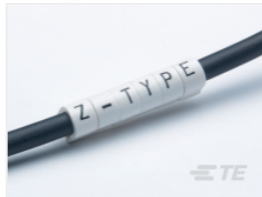
TE Part #EC1051-000 06181914