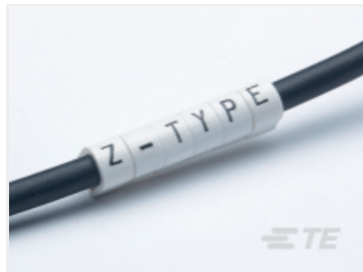
TE Part #EC1055-000 06181918