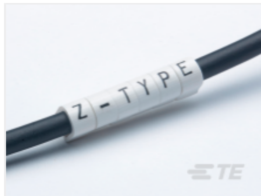
TE Part #EC1045-000 06181908