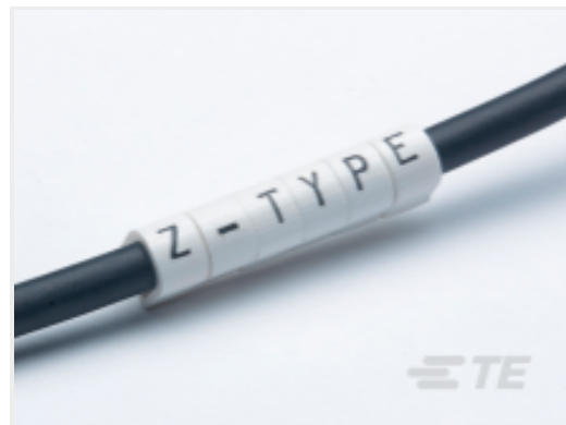
TE Part #EC1047-000 06181910