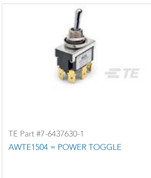
TE Part #7-6437630-1 AWTE1504 = POWER TOGGLE