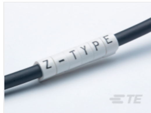
TE Part #EC1040-000 06181903