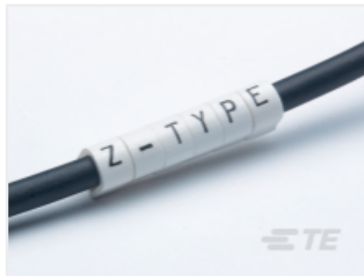
TE Part #CAT-T3437-Z1 Z-Type Push-On Markers