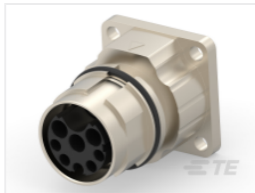
TE Part #BEA906N0000150A000 917 RECEPTACLE, SPEEDTEC-READY