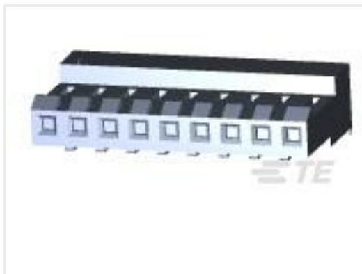
TE Part #3-640427-9 09P MTA156 CONN ASSY 20AWG YEL