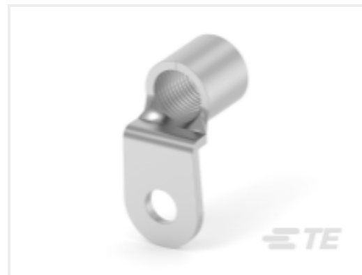
TE Part #320383-1 TERMINAL,SOLIS R 2 1/4 90DEG