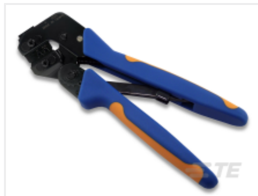
TE Part #1976143-1 SDE COMMERCIAL TOOL OR DIE