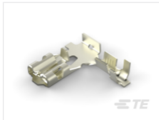
TE Part #2238105-1 250 POS LOCK REC FLAG 16-14 NISTL