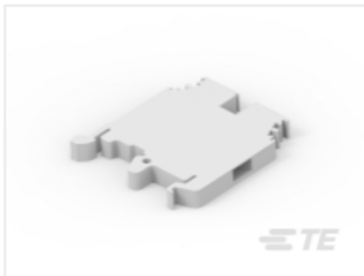
TE Part #1SNA115206R2200 MTC6