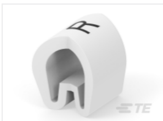
TE Part #EC1611-000 06241927