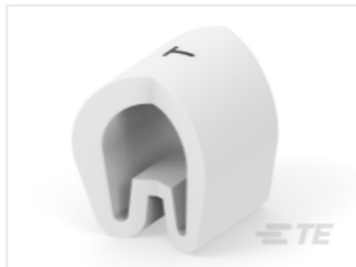
TE Part #EC1613-000 06241929