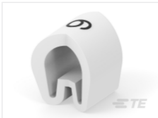
TE Part #EC1677-000 06243909