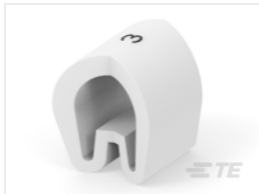
TE Part #EC1671-000 06243903