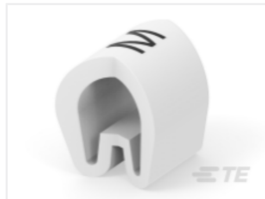
TE Part #EC1606-000 06241922