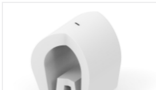
TE Part #EC0959-000 06173938