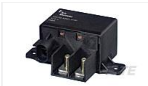
TE Part #1-1393315-1 V23132B2002B200=HCR