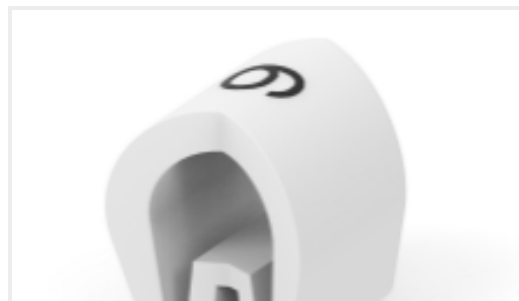
TE Part #EC0930-000 06173909