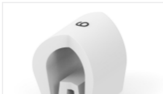
TE Part #EC0927-000 06173906