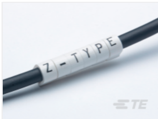
TE Part #EC0845-000 06171923