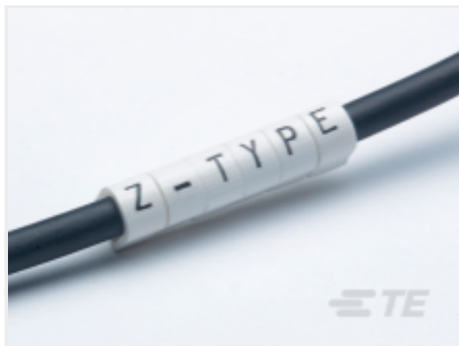
TE Part #EC0246-000 05811933