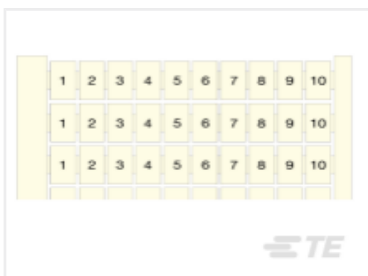
TE Part #1SNA231007R2200 RC510 51->60 (X10) HORIZONTAL