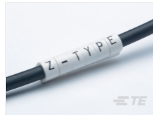
TE Part #EC0593-000 06161911