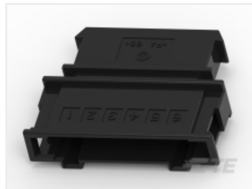
TE Part #1563772-1 6POS,TAB 2.8X0.8,TAB HSG,NO 2. LOCK,BK