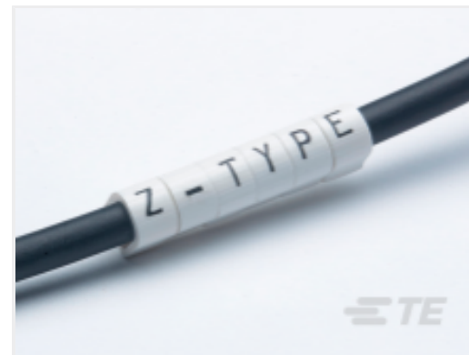
TE Part #EC0571-000 06161000