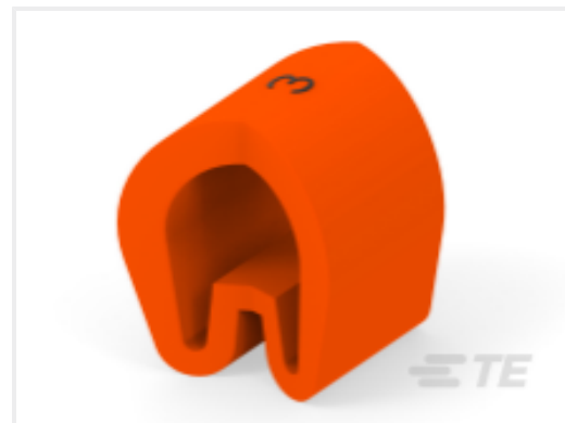
TE Part #EC1396-000 06221303