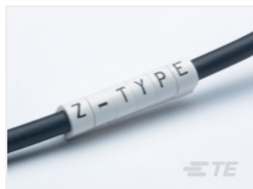
TE Part #EC0249-000 05811936