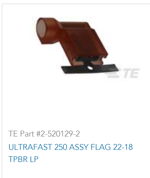
TE Part #2-520129-2 ULTRAFast 250 ASSY FLAG 22-18 TPBR LP