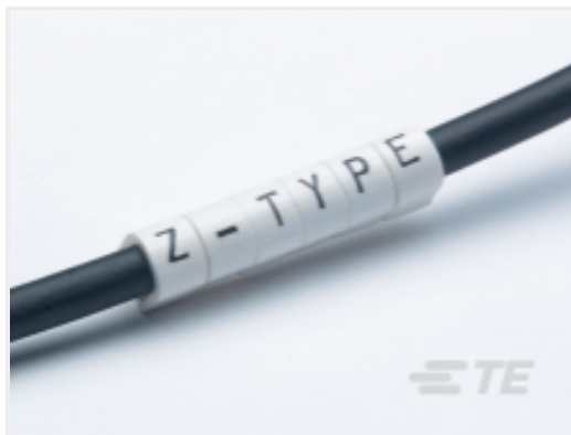
TE Part #EC0622-000 06161940