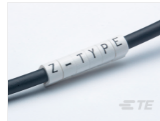
TE Part #EC0613-000 06161931