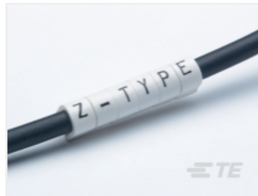
TE Part #EC0619-000 06161937