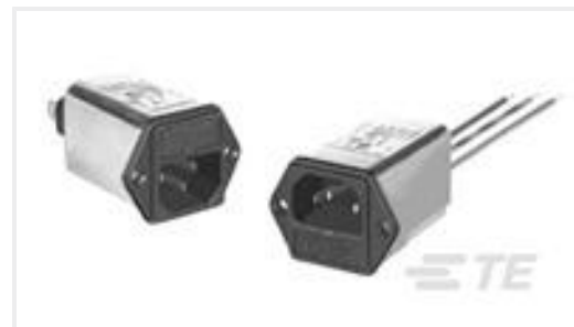
TE Part #6609115-3 1EGG1-2 (NEW GEN=F7642D S0