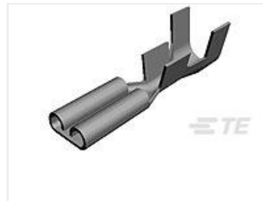
TE Part #41274-1 250 FASTON,REC.,18-14 AWG,TPBR