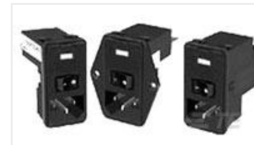
TE Part #8-6609107-1 PS0S0DSXB=C1265