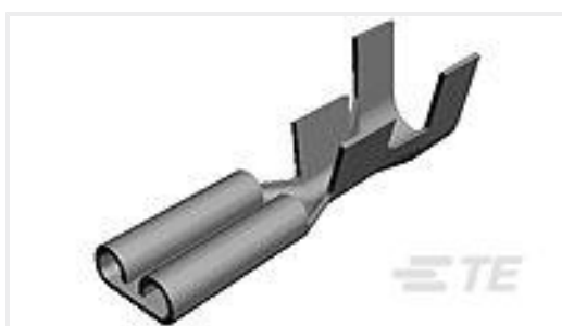
TE Part #41274-1 250 FASTON,REC.,18-14 AWG,TPBR