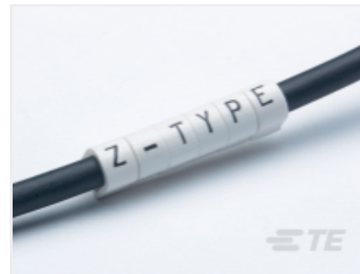
TE Part #EC0619-000 06161937