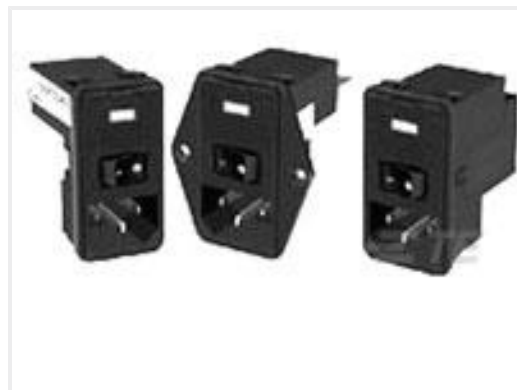
TE Part #8-6609107-1 PS0S0DSXB=C1265