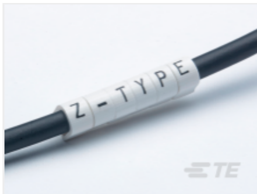
TE Part #EC0572-000 06161101