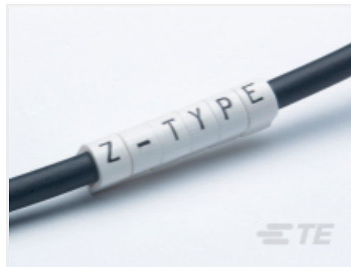
TE Part #EC0622-000 06161940