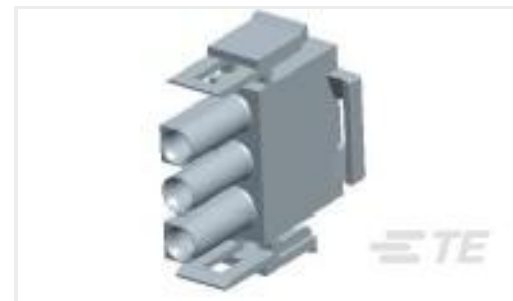
TE Part #1241809-2 UMNL ST-SOCK,A-P 3P