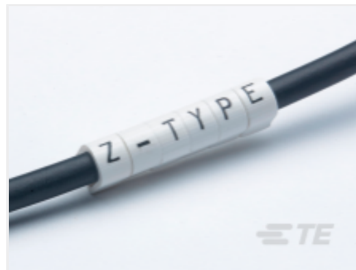
TE Part #EC0584-000 06161902