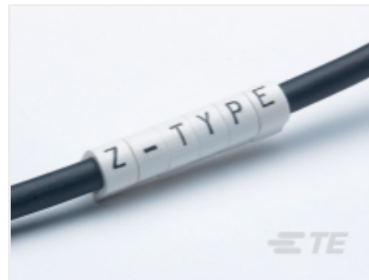
TE Part #EC0215-000 05811902