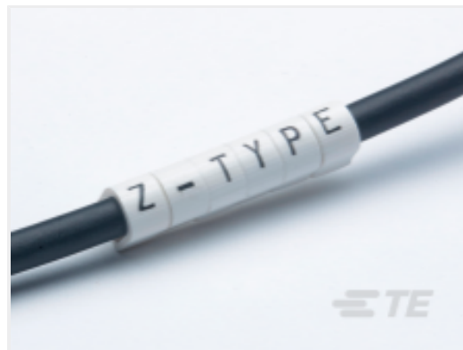
TE Part #EC0605-000 06161923