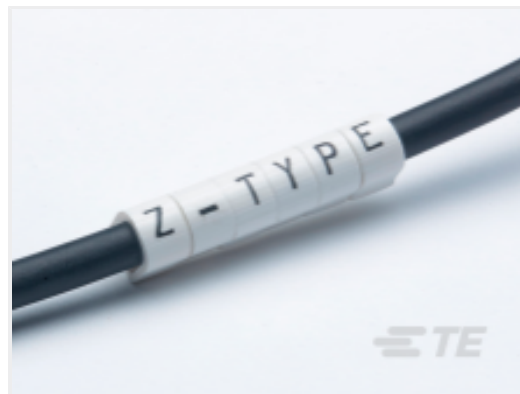
TE Part #EC0619-000 06161937