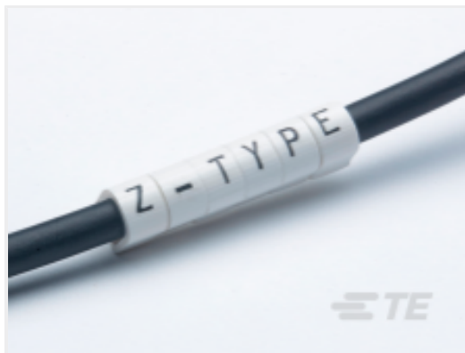
TE Part #EC0583-000 06161901