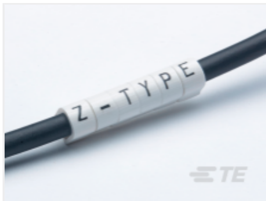
TE Part #EC0591-000 06161909