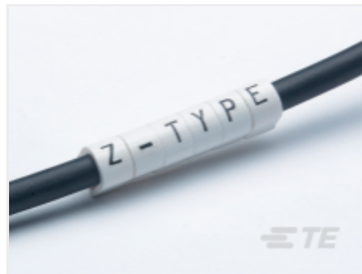
TE Part #EC0585-000 06161903