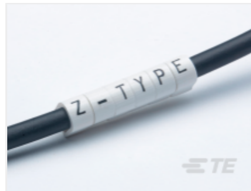
TE Part #EC0220-000 05811907