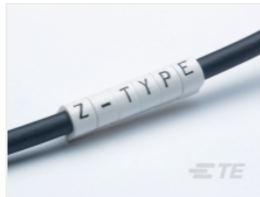
TE Part #EC0591-000 06161909