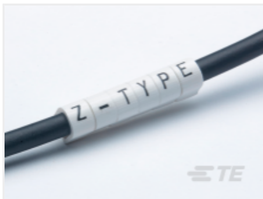
TE Part #EC0572-000 06161101