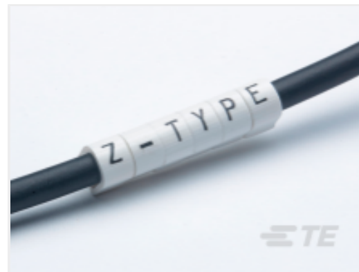
TE Part #EC0571-000 06161000