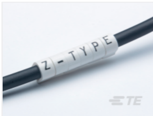
TE Part #EC0575-000 06161303