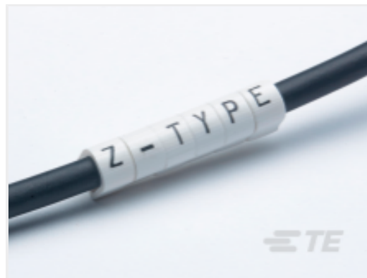
TE Part #EC0180-000 05811202