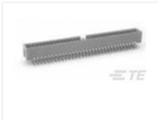
TE Part #2-1761605-9 IDC LOW PRO HDR 26P RA BLUE