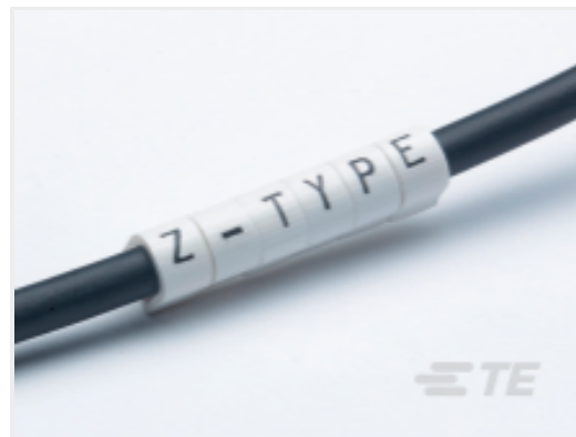
TE Part #EC0573-000 06161202