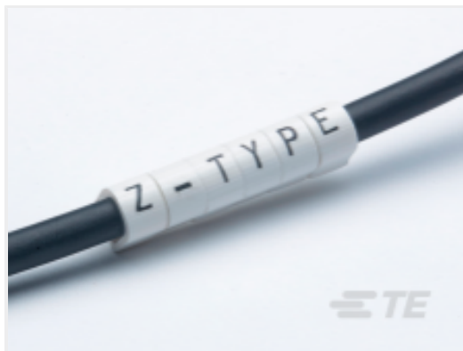
TE Part #EC0578-000 06161505