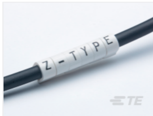
TE Part #EC0580-000 06161707