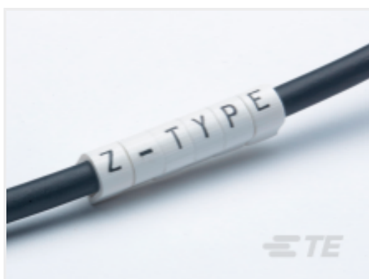
TE Part #EC0039-000 05801808