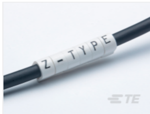
TE Part #EC0573-000 06161202