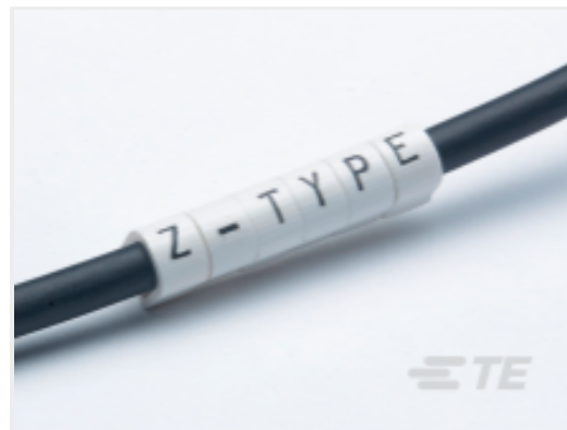
TE Part #EC0581-000 06161808