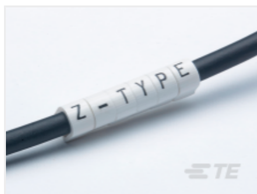
TE Part #EC0571-000 06161000