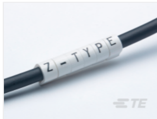
TE Part #EC0183-000 05811303