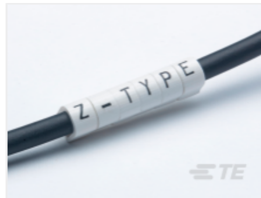
TE Part #EC0572-000 06161101