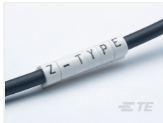
TE Part #EC0579-000 06161606