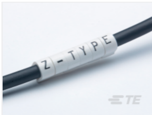
TE Part #EC0180-000 05811202