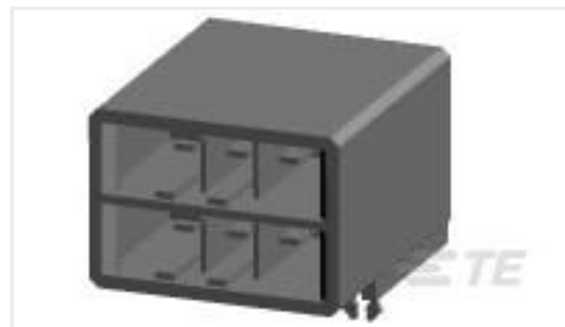
TE Part #2-178140-2 DYNAMIC D3200 HDR V ASSY 6P PdNi & Au