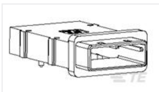
TE Part #1888321-1 Shielded Receptacle Assembly,