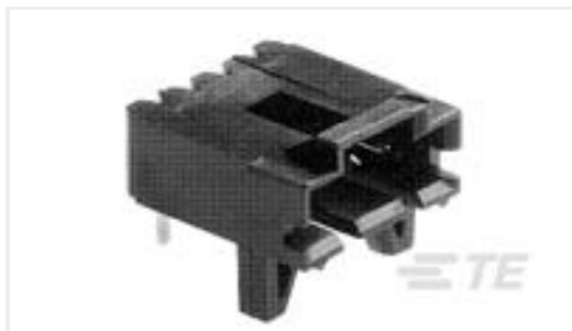
TE Part #5-103904-5 6 MTE HDR SRRA LATCH W/HLDWN