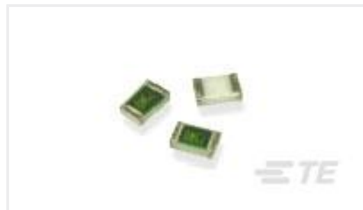
TE Part #1676290-1 RN 0805 2K49 0.1% 10PPM CUT LENGTH