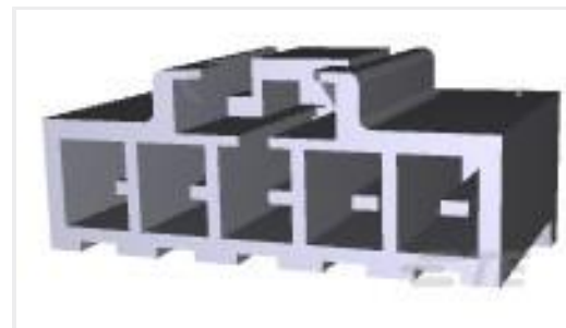
TE Part #178488-1 UP 3.96 5P TAB HDR NAT TYPE 1