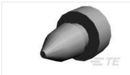
TE Part #211108-1 SOC HDR METRIMATE KEY PLUG