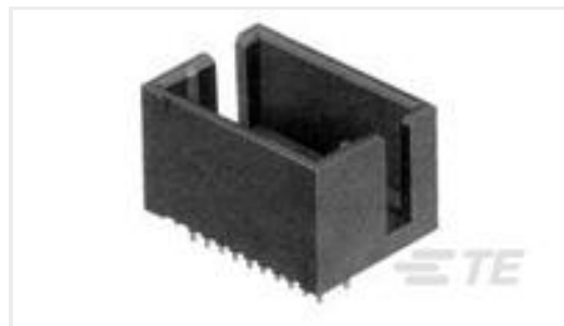
TE Part #5-104076-3 40 SYS50 HDR DRST SHRD W/SL SN