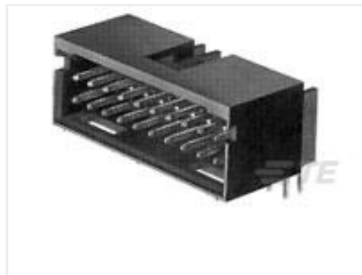
TE Part #5-103166-8 20 MODII HDR DRRR SHRD LF