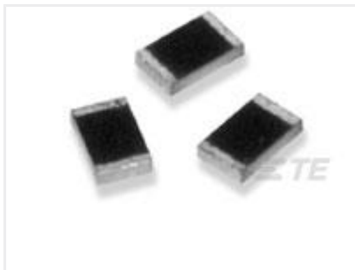
TE Part #8-1879253-3 RP 2B 20R 0.1% 15PPM 1K RL