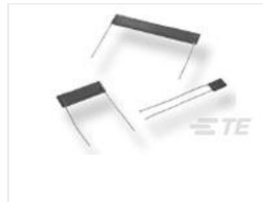
TE Part #3-1625958-8 HB01RE 5M0 1% 100PPM