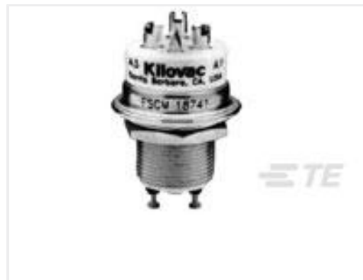
TE Part #3-1618274-6 HC-3=RELAY, VACUUM, SPDT