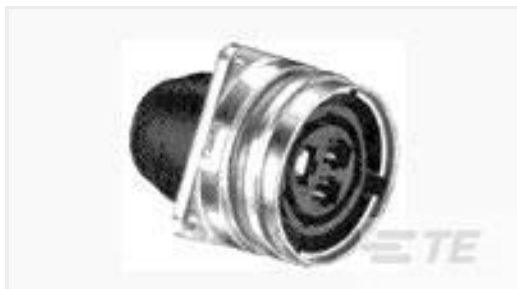
TE Part #208485-1 CMC RECPT ASSEMBLY SIZE 28