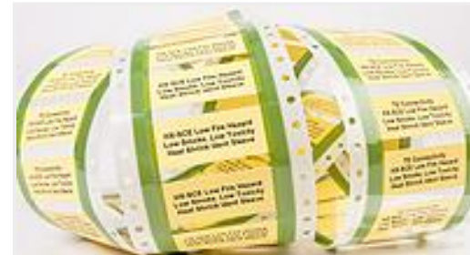
TE Part #F93116-000 HX-SCE-2.5K-6.4-50-S1-4