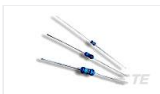
TE Part #1622531-1 LR1 1% 5K6