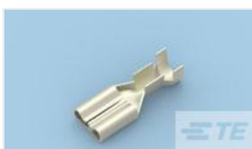
TE Part #1742883-1 187 FASTON,REC.,20-16 AWG,NPST