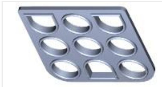
TE Part #794277-1 09P UMNL INTERFACE SEAL