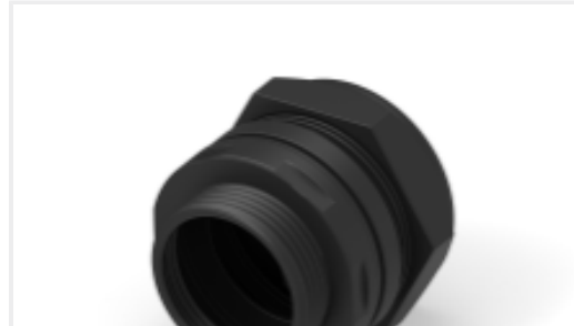
TE Part #1478769-6 ANTI-VIB NYLON GLD 32MM BLK