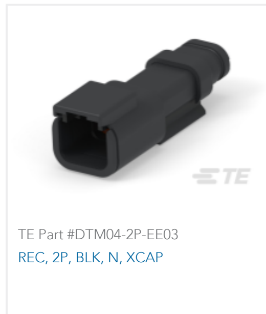
TE Part #DTM04-2P-EE03 REC, 2P, BLK, N, XCAP