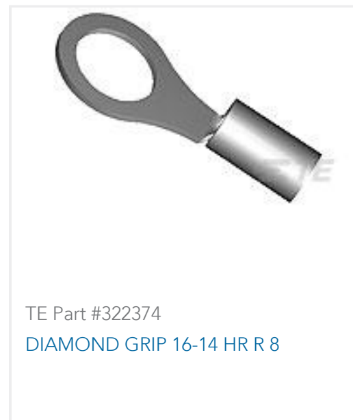
TE Part #322374 DIAMOND GRIP 16-14 HR R 8