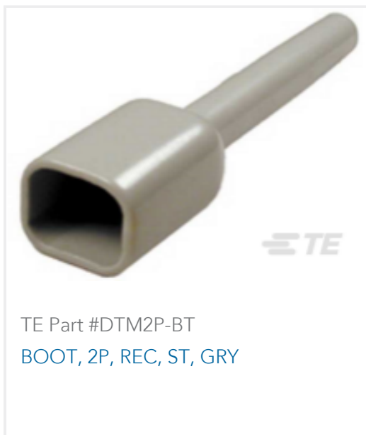
TE Part #DTM2P-BT BOOT, 2P, REC, ST, GRY