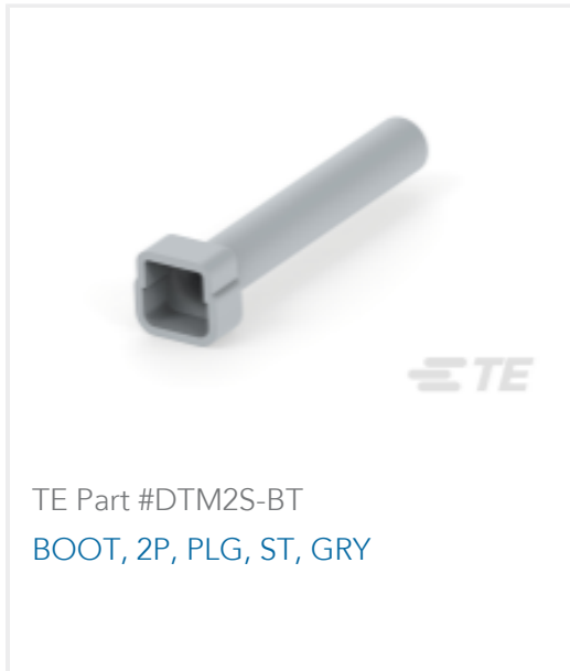
TE Part #DTM2S-BT BOOT, 2P, PLG, ST, GRY