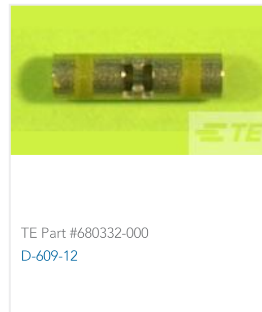
TE Part #680332-000 D-609-12