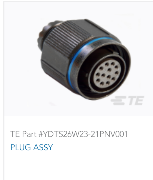
TE Part #YDTS26W23-21PNV001 PLUG ASSY