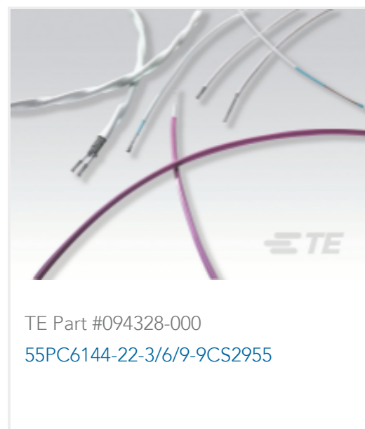
TE Part #094328-000 55PC6144-22-3/6/9-9CS2955