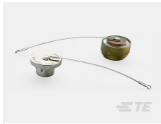
TE Part #CAT-D38999-DIV1A D38999: Circular Connector Caps and Covers