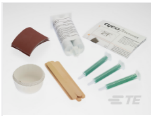
TE Part #657863-000 S1125-KIT-8