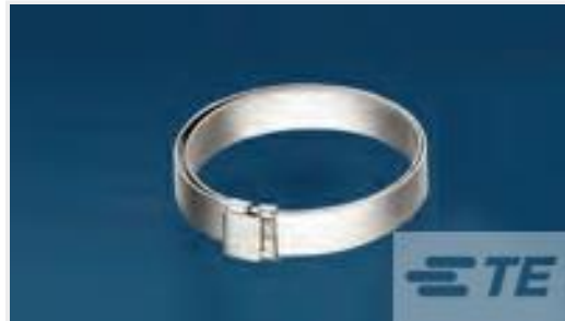
TE Part #CW2824-000 R85049/128-7