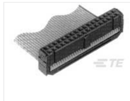
TE Part #1658622-9 40 NOVO MIL/CTR 30DP, LEAD FREE