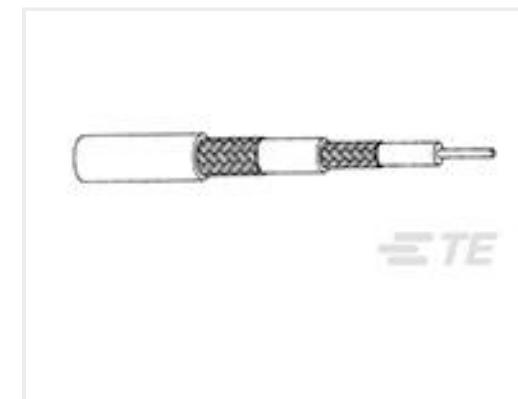
TE Part #430079-000 7528A5314-0