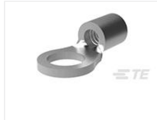
TE Part #34104-6 SOLIS R 22-16 4 NIPL